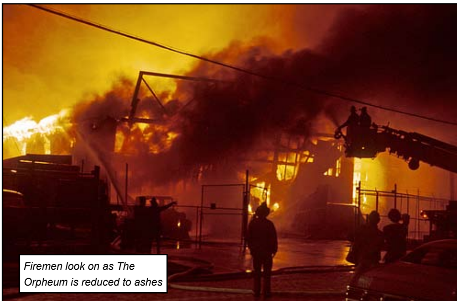
Firemen look on as The Orpheum is reduced to ashes

The Rising Deck's squad and entourage of caterers, medical team and security are booked to leave Cornwall at 7.30 tomorrow evening for the flight to Spain, where they will be kept informed of the developments at The Orpheum. Family, friends and well wishers will be there to wave them off, so get there early as traffic is expected to be heavy !